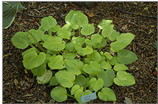
Vanilla Cream Hosta