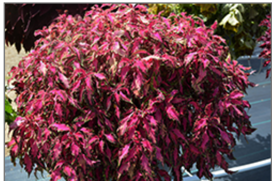
Stained Glassworks Luminesce Coleus