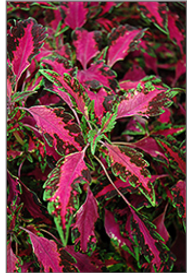
Stained Glassworks Luminesce Coleus foliage