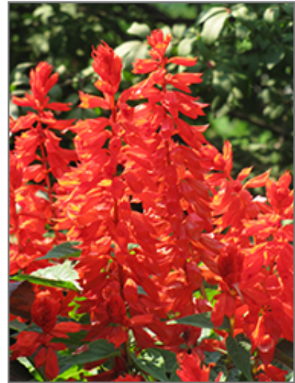
Lighthouse Red Sage flowers