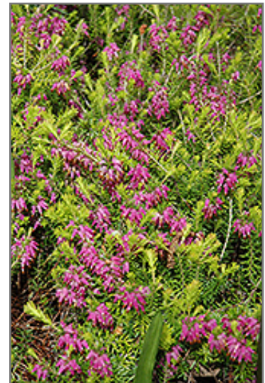
Myretoun Ruby Heath flowers